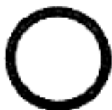
OR 1017G (OV)